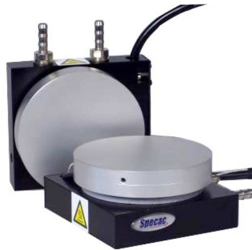
Specac's Heated Platens

Coldseal adhesive applied to the uncoated side (intended to seal the product after packaging), could be affected by the ink, or could cause film adhesion during storage if formulated incorrectly or not optimized. The films tested after 16 hours and 4 months showed no sealing failure. Generally, the maximum permissible ink block adhesion measure read on a tensiometer is for a 50gm weight applied across a 2 inch length to separate 1 inch wide of printed film.