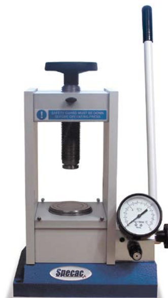
Specac's Hydraulic Press

Gravure printing has gained widespread use because of high quality prints obtainable. It is however more expensive to change print design than with flexographic printing and therefore more cost effective for high quality volume or repetitive applications.